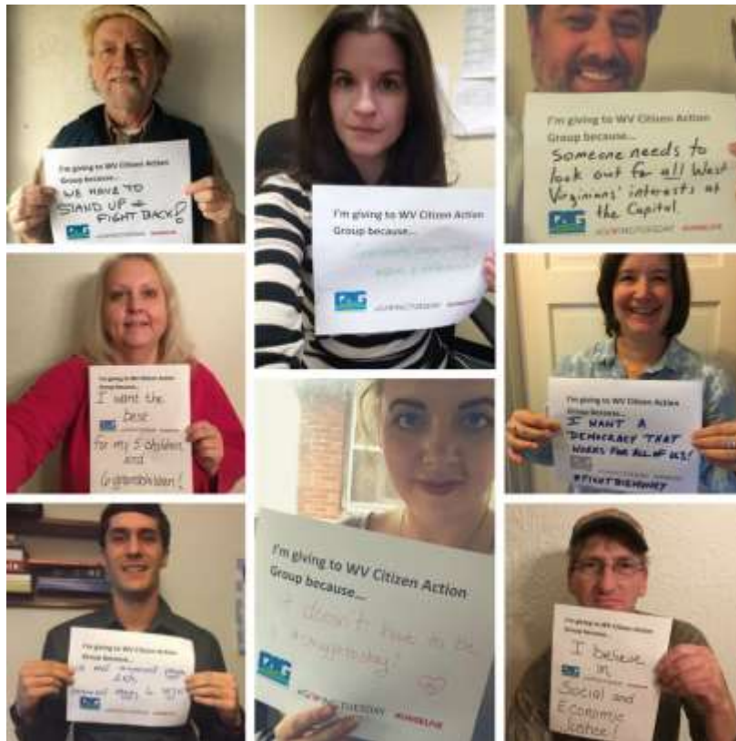
Staff and supporters shared the reasons they gave to WV Citizen Action on #GivingTuesday, a global day dedicated to giving back.

membership . We thank each and every one of you for commitment and generosity!