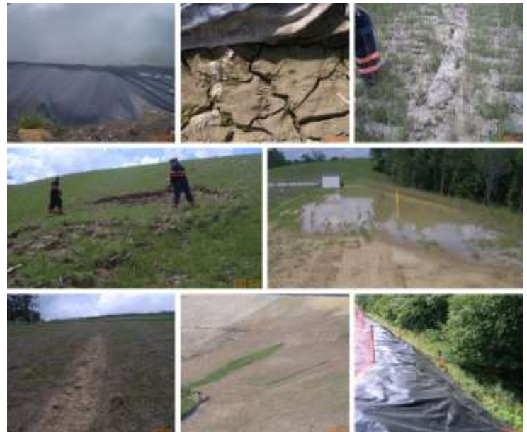
Documented problems with pits identified during a study conducted by WVU. [Source: Pits and Impoundments Final Report For Assessing Environmental Impacts of Horizontal Well Drilling Operations, WVU Department of Civil and Environmental Engineering, December 17, 2012.]

The organizations on the lawsuit—captioned Environmental Integrity Project et al. v. McCarthy , No. 1:16-cv-