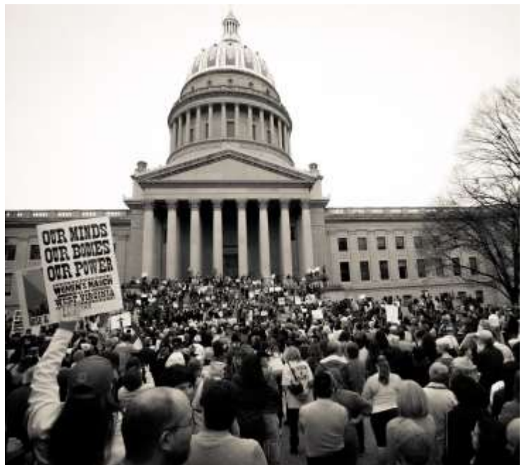
Every state, and even many countries, hosted "sister" marches to the Women's March on Washington. This was the scene at the WV State Capitol on Saturday, January 21st.

Millions marched in the US, including over 3,300 at the WV capitol. This is the kind of citizen action we need to push back on the new administration and in-state at the legislature.