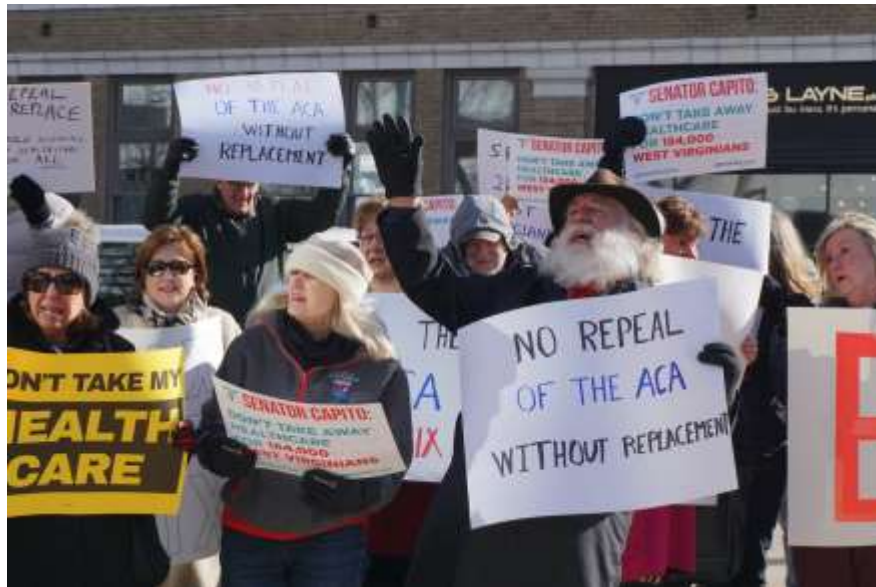
"We wish you affordable healthcare and a happy New Year!" Concerned citizens rallied outside of Senator Capito's Charleston office to protest Republican's plans to repeal the Affordable Care Act..

healthcare system. Conservatives in Congress have voted over fifty times to repeal the ACA without a clue as to how to replace it to keep Americans' health coverage intact. Now they'll have a president who will actually sign such a crazy bill, several are having second thoughts, including Senator Capito.