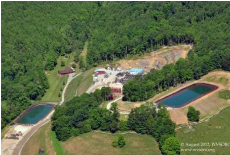
Before drilling: Almost heaven. After drilling: Increased setbacks and monitoring for noise, dust, and other air emissions are needed to protect the health and property values of those living nearby.

The money that goes into the Oil and Gas Reclamation Fund comes from two sources. One of these is a small fee drillers pay when they apply for new drilling permits. Money also goes into the fund when the DEP forfeits the bond of a driller who has not plugged a well that should be plugged or causes some other problem. This does not happen very often.