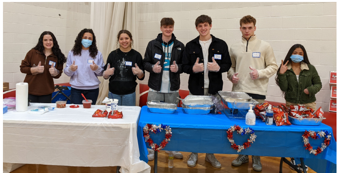
Rock The Vote event hosted by the Black Voter Impact Initiative and friends at South Charleston High School.

None of this would have been possible without our incredible allies and partners, and our phenomenal members and volunteers. Thank YOU! §