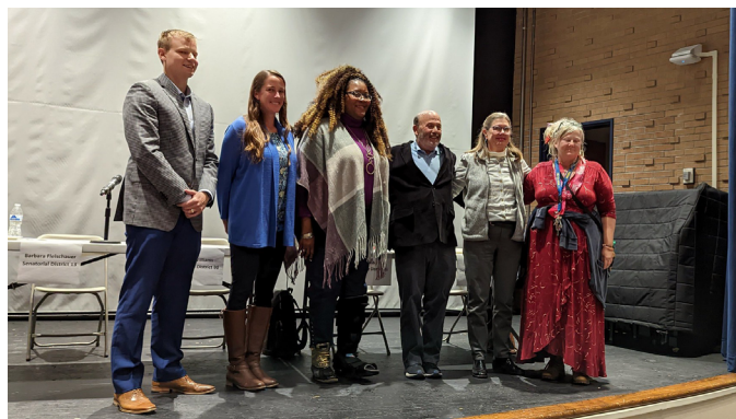
Morgantown Climate Candidate Forum.

The defeat of these constitutional power grabs was a win for democracy at the state level, but Election Day generally was a big win for democracy across the country. For