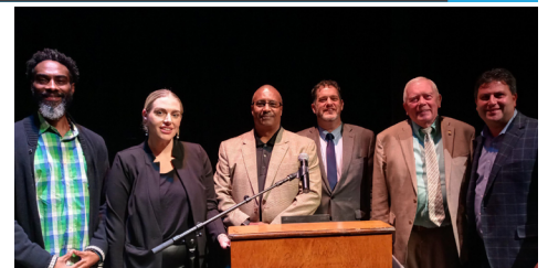
Democracy Wins at the Ballot Box pg 3

Expect another fight within the Republican caucus over the best way to give away our state's operating revenue in the form of tax breaks for the rich rather than fully fund state agencies and keep them staffed. Perhaps if we paid our correctional officers an adequate salary, the Governor could rescind the state of emergency he's declared in order to send our National Guard troops into our jails and prisons to