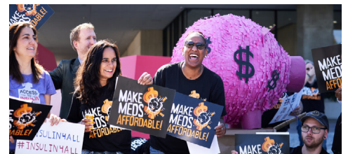
Health Care: A Year in Review pg 4

Envisioning West Virginia: WV New Jobs Coalition's Visioning Project pg 6