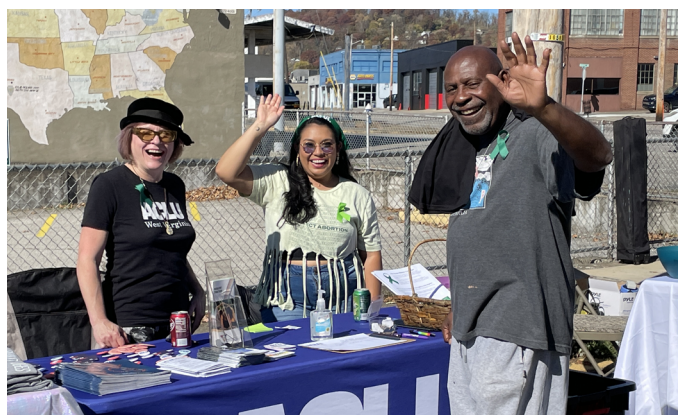
ACLU and friends hosting a booth at the Halloween Party to the Polls event at Five Corners

Although the results down ballot in West Virginia were not what we'd hoped for, we're proud of West Virginia voters for coming together and defending their right to