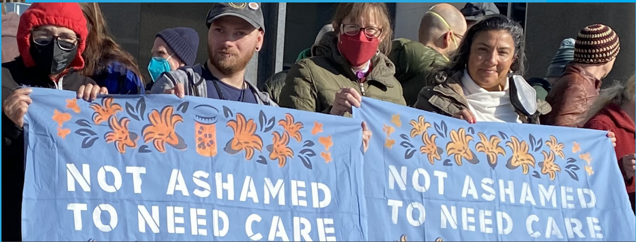
WVCA members participated in the #CareOverCost Direct Action outside Elevance Health in Indianapolis (pg4).