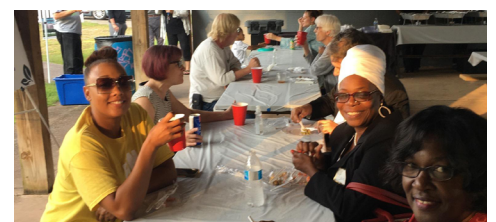
2022 Awards Picnic pg 10

At the end of the year, we need to look back on the actions and activities of 2022, take some time off to reflect, rest, and recharge, and then lean into the legislative session and next year's campaigns. To effectively do this we need YOU, our members and supporters, to both stay active, renew your membership and/or make a tax-deductible donation to our Education Fund. You'll find the membership renewal/donation form on the back page of this newsletter. Fill it out and send it in, OR donate online at wvcag.org/membership or wvcaef.org/donation-info .