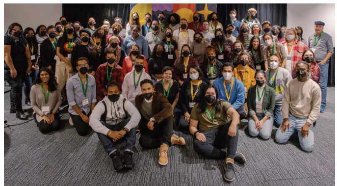
Green New Deal Conference group photo.