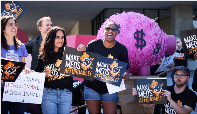
WVCAG members at DC protest outside HHS..

weekly petition emails for a couple months at this point, and delivered all the signatures to their offices on the day of the protest. A week later, President Biden signed an executive order to empower the HHS to explore all options to lower prescription drug costs for middle class families.