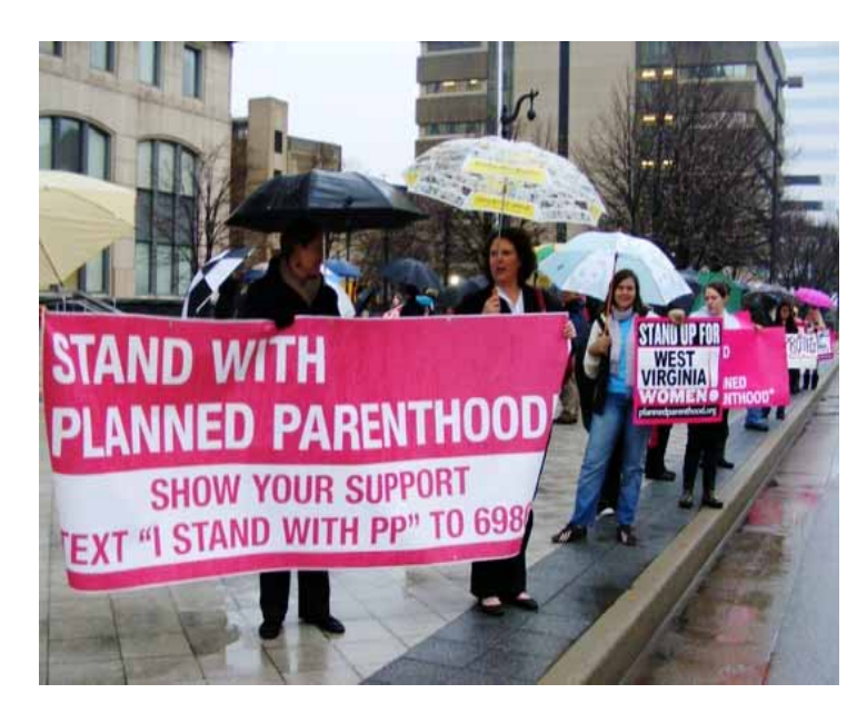
Weather Didn't Deter These Ladies From Making Their Presence Known!

Thursday evening's rally to protect Planned Parenthood from the congressional budget chopping block was wet but wonderful! Folks turned out with umbrellas, cheers and smiles at the Federal Courthouse in Charleston to draw attention to the current fight over women's reproductive health. For more information, read the article in the Charleston Gazette <u>here</u>. And check out the pictures below!