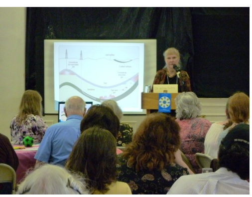
Dr. Wilma Subra discusses the health impacts associated with the shale gas development at the 2012 Wellness & Water conference.

Wellness & Water II participants agreed that we need to