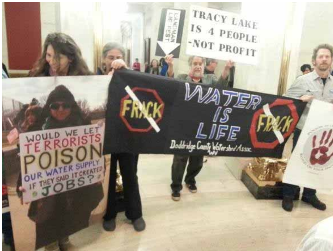
Fracktivists gather at E-Day